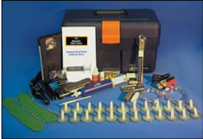
Max Vac UV24